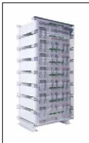
Horizontal stack assembly