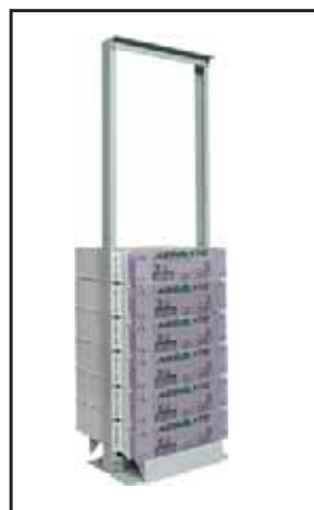
Relay rack modules