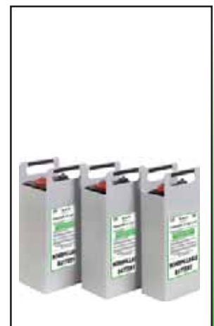
Single cell module